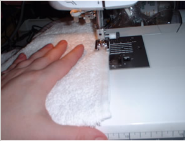
5. sew up sides leaving 4 to 5 inches open on top and bottom of side seam.