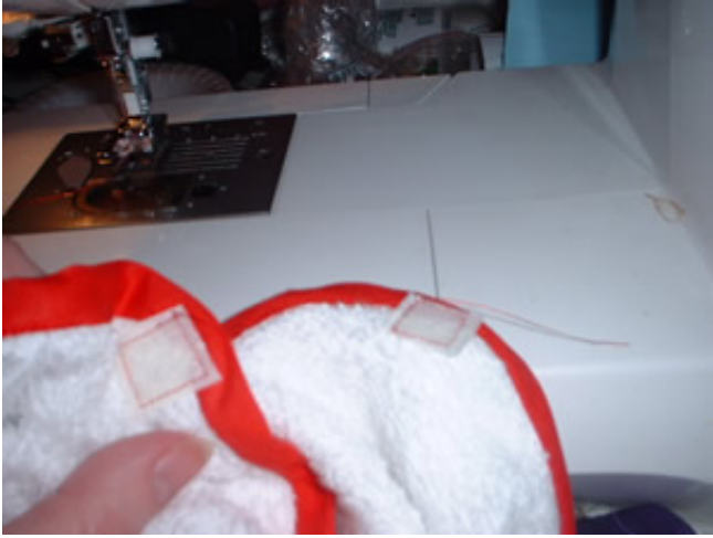
4. add one Velcro snap at neck back